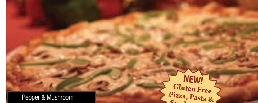
Pepper & Mushroom

NEW! Gluten Free Pizza, Pasta & Sandwiches!