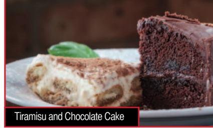
Tiramisu and Chocolate Cake