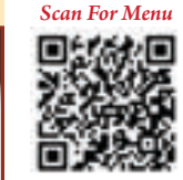
Scan For Menu